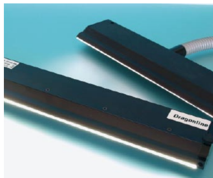
The new LED-Dragonline (front) in comparison with a Volpi fiber optic lightline in the background

depends on the lamp type and selected intensity at which the light source is operated. Frequent on/off switching also has a detrimental effect on the service life of a halogen lamp. Costs arise for purchase of the numerous replacement lamps as well as for maintenance and machine downtime as usually the entire process must be temporarily stopped during lamp replacement. The overall profitability of the new LED line lights is many times higher than that of conventional line lights.